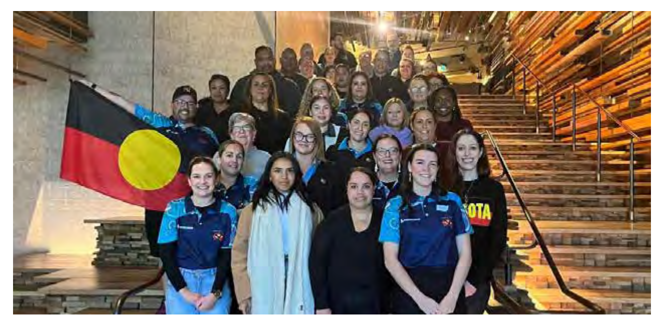
Culture Care Connect aftercare staff attending the NACCHO Aftercare Onboarding Workshop in Canberra, June 2023.