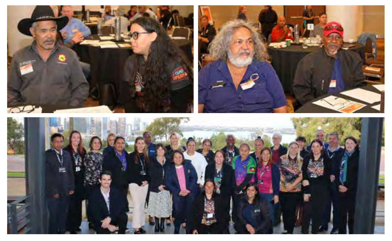
AHCWA's 2022 Environmental Health Conference, October 2022.