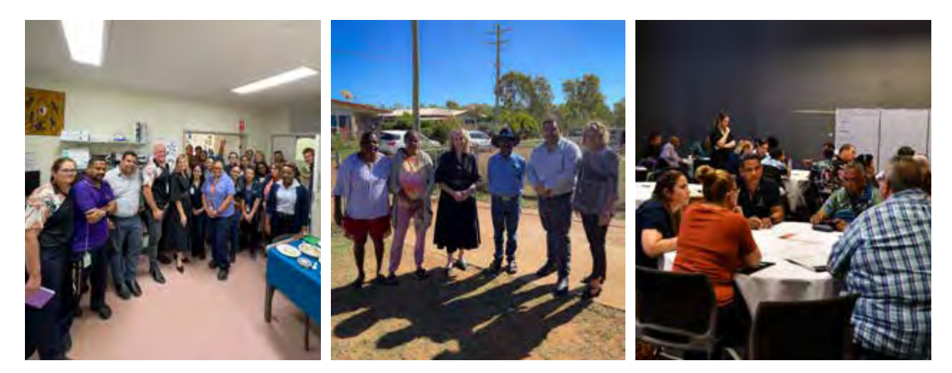
QAIHC Team in the office, on-site and at the National Workforce Summit, 2022.