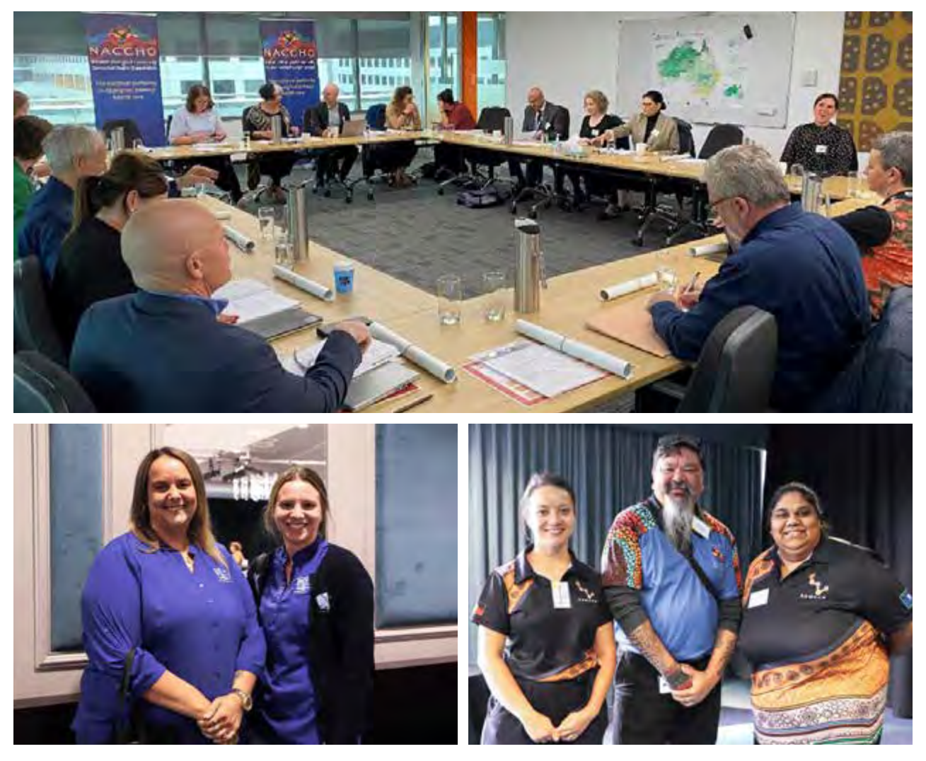
Top: Inaugural cancer roundtable meeting, May 2023. Bottom-left: National Workforce Summit delegates. Bottom-right: National Workforce Summit NACCHO representative (middle) and delegates.

the two days. When sharing back to the room, many stated they would be able to take immediate actions and deliver on their goals within the next 12 months.