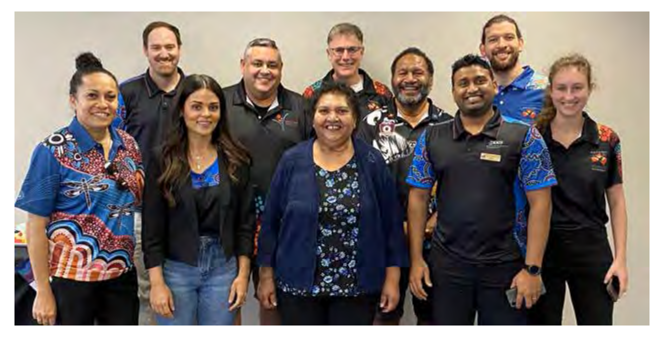
Governance workshop on Bindal and Wulgurukaba Country (Townsville) with representatives from Mulungu Aboriginal Corporation Primary Health Care Service, North Coast Aboriginal Corporation for Community Health, King & Wood Mallesons and NACCHO staff.