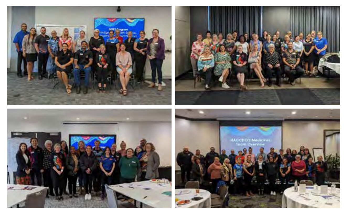
Clockwise from top-left: IHSPS workshops in Brisbane, Darwin, Melbourne and Sydney.