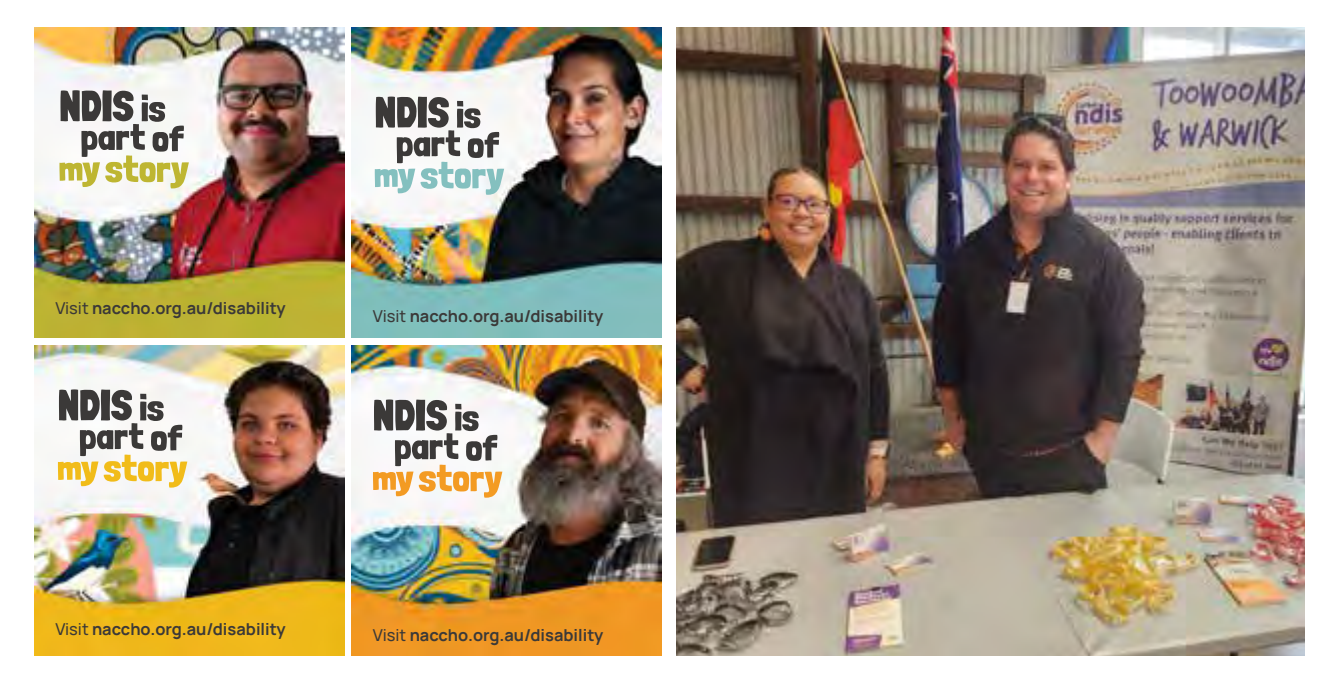
Left: NDIS is part of my story resources. Right: Carbal NDIS Support Services – Toowoomba.

With the winding down of NDIS Ready on 30 June 2022, DHAC provided a further year's funding to NACCHO to continue its work in disability advocacy. The Care and Support Ready program incorporated an added focus on integration of care across the disability and aged-care sectors. Project officers were employed in the affiliates to build ACCHOs' capacity across these service areas. They assisted in identifying potential and existing delivery models that integrated aged care, disability and primary healthcare. NACCHO actively advocated for further investment in capacity building; however, the Care and Support Ready program is now complete.